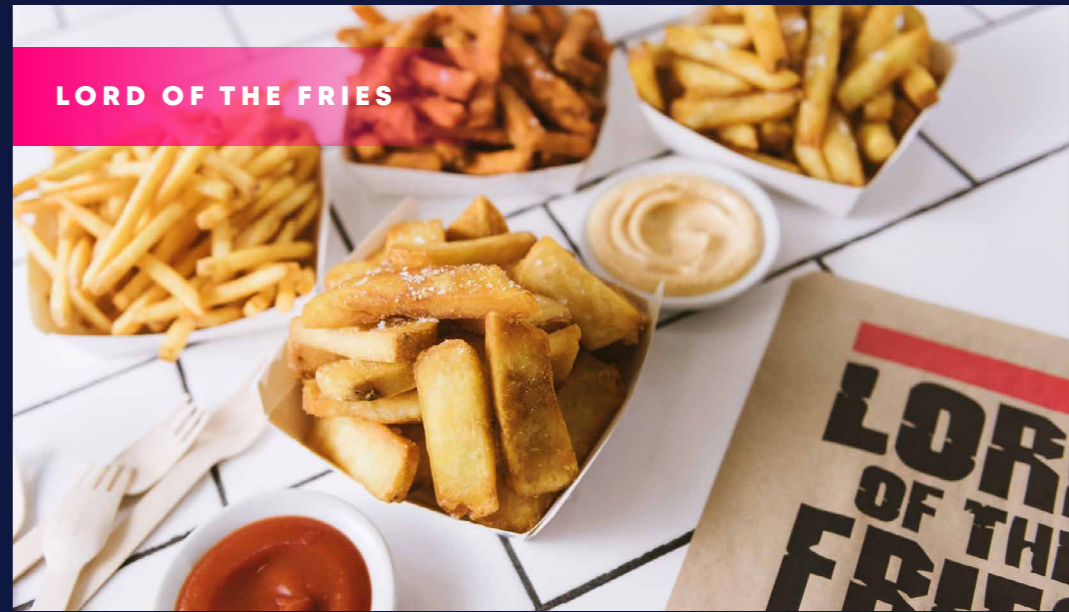
LORD OF THE FRIES